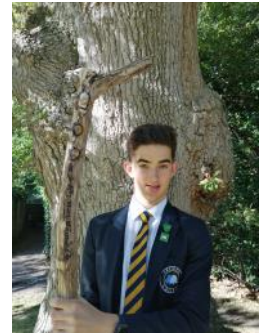
The Great Staff.....