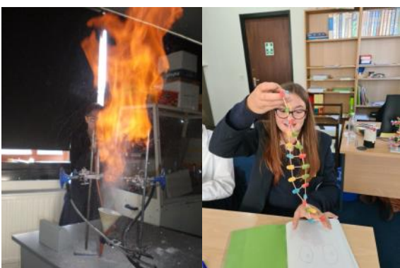
Year 11 studying chemical reactions, and Year 9 DNA