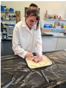
Year 10 doing heart dissections..