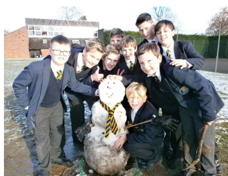
Key Stage 3