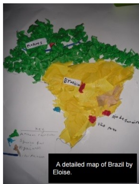
A detailed map of Brazil by Eloise.

Year 6 have completed some fantastic creative story writing which is full of suspense and adventurous vocabulary. Younger pupils in Miss Carpenter's class have completed some impressive non-fiction writing about different aspects of the rainforest. Miss Beaumont's class have created some beautiful maps to help them learn about the climate and geographical features of Brazil.